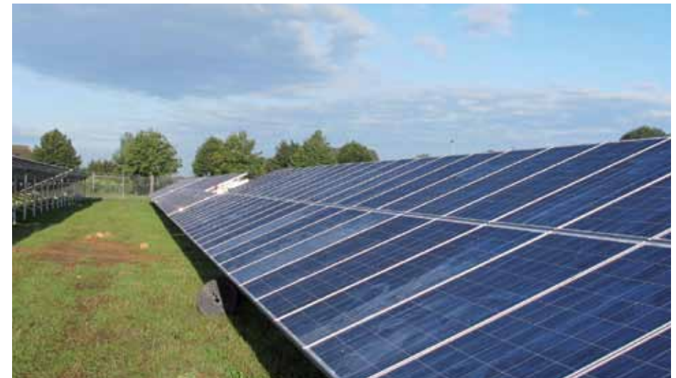
Krannich | Domsühl - Germany System: 1 MW | N-Rack System - Screw foundation