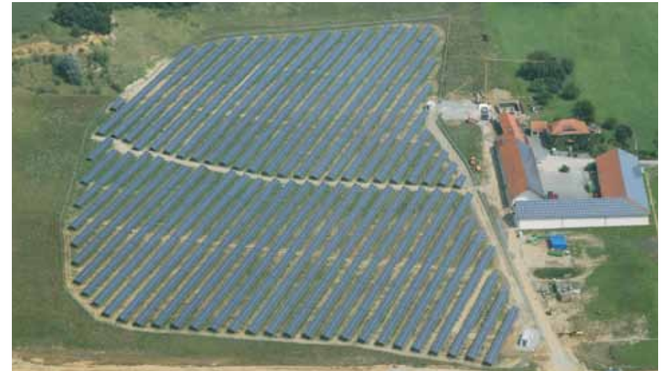
Novatech | Mallersdorf-Pfaffenberg - Germany System: 3,463 MW | N-Rack System - Screw foundation